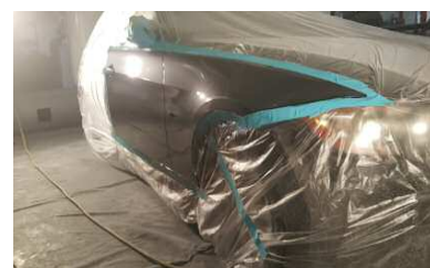
A vehicle is prepped for paint inside the shop's portable paint booth by Mobile Environmental Solutions